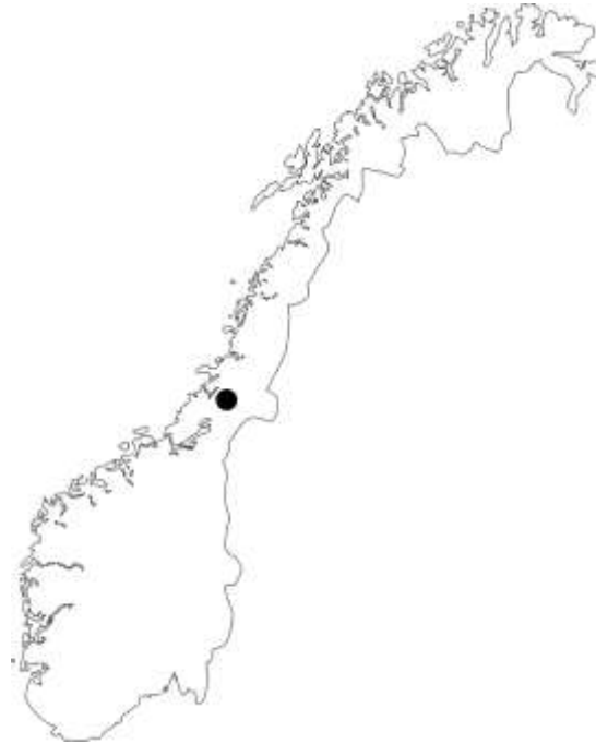
Figure 1. Map of Norway showing sampling location (Namsen river).

regions of possible gene-loss. Primers were designed for a set of gene-loss candidates using Primer3 ( http://bioinfo.ut.ee/primer3-0.4.0/primer3/ ). PCR was performed according to the manufacturer's instructions using Tfi DNA polymerase (Life Technologies, Oslo, Norway). The PCR cycling conditions were 94°C for 2 min; 30 cycles of 94°C for 30 s, 55°C for 30 s, 72°C for 1 min, and a final extension step at 72°C for 10 min. Amplified products were analyzed using an Agilent 2100 Bioanalyzer using a DNA 1000 kit (Agilent Technologies). PCRs were performed using DNA from the same Namsblank specimen as was originally submitted for sequencing in addition to a small panel of anadromous Atlantic salmon specimens samples from Norwegian (wild and farmed) and Irish (farmed) locations.